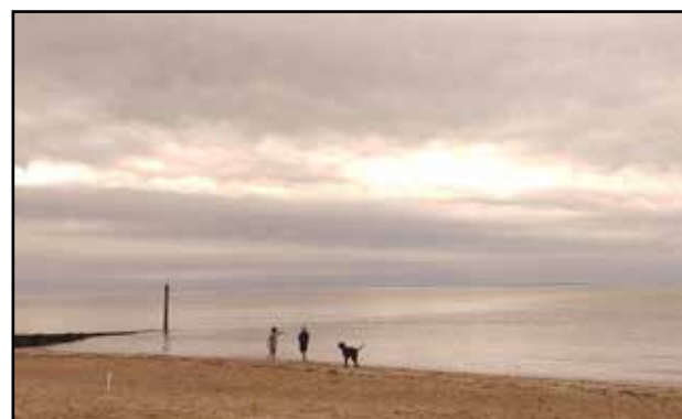
Runner-up; Peter Leis

Go to our Facebook "Photo Contest" to view all photos!