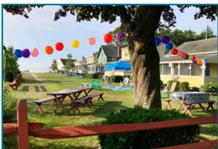
Artistic: second place winner; Teri Filippi Seibert

Go to our Facebook "Photo Contest" to view all photos!